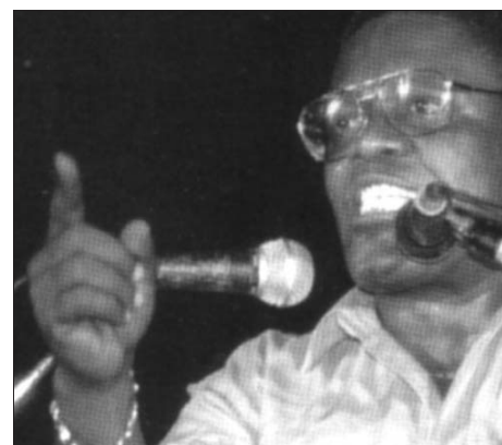
Ingraham ...Former Prime Minister

By sabotaging Tommy and Dion, Ingraham showed the FNM that although they got rid off him in 2002, he was and is still in charge of the FNM and that there are few men in that party who can stand up to him and be man. Whether Tommy and Dion recognize it or not, Ingraham's return has sent the