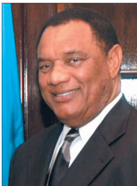
Rt. Hon. Perry G. Christie Prime Minister of The Bahamas

The Bahamas is Better Today than ever before in our history.