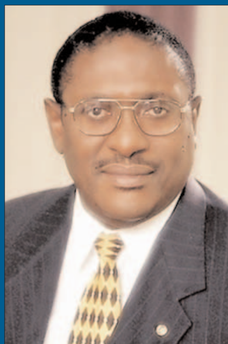
Hon. Bradley Roberts Minister of Works & Utilities