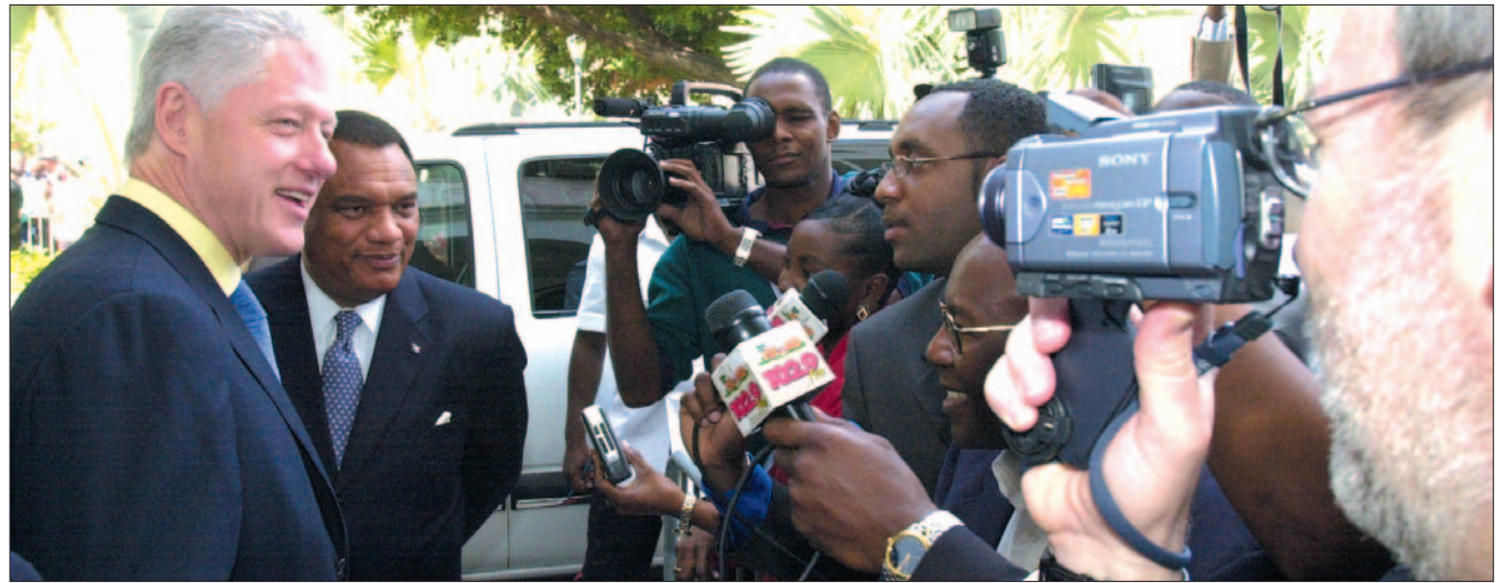
Prime Minister Christie welcomes the Press and Former US President Bill Clinton at the Churchill Building.

The Bahamas needs a leader for all times. A leader that has respect for others, that listens to trade Union leaders and leaders of the Church. One who is not afraid to be seen in Church and at the pulpit. One is a family man and who holds family values close to his heart. There is no doubt that Perry Christie remains the best man for the job of running the affairs of this nation and the electorate will vote for him once again in the next general elections.