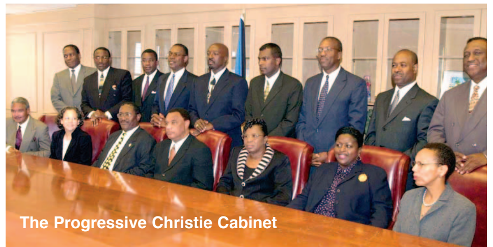
The Progressive Christie Cabinet

The PLP is very proud of the work of this government. Our efforts to bring real economic opportunities to the Bahamian people will not stop. Our mandate is to ensure that all Bahamians enjoy a high standard of living that is compared to none in this region. The anchor project policy of this government has been a tremendous